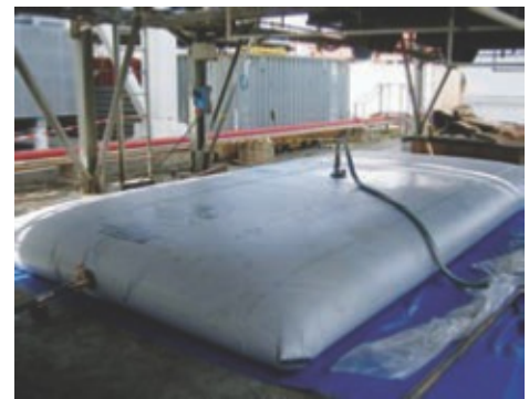
20 m 3 transformer oil (HAYN)