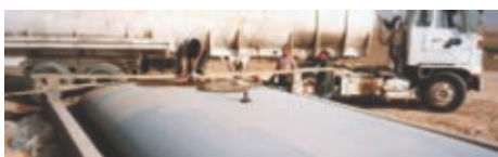
40 m 3 fuel with retention (nitrile)

Withstands to the most corrosive products, D & H flexible tanks are the most reliable and economical solution, used by numerous armies throughout the world.