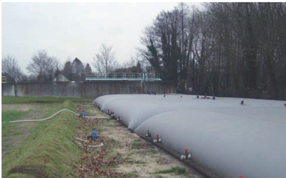
3 x 300 m 3 agri-food slurry