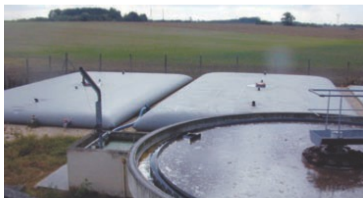
2 x 150 m 3 urban slurry