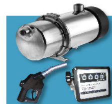
Pumps & Accessories