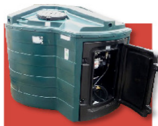
Bunded Diesel Tanks

Steel Plastic Pumps, Filters & Flow meters