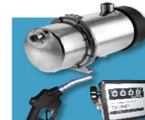
Pumps & Accessories