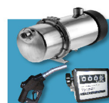
Pumps & Accessories