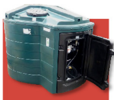
Bunded Diesel Tanks

Steel Plastic Pumps, Filters & Flow meters