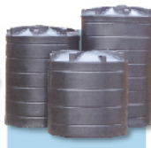
Water Storage Tank

Steel Plastic Pumps, Filters & Flow meters