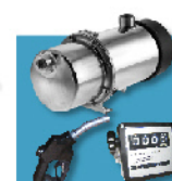
Pumps & Accessories