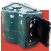
Bunded Diesel Tanks

Steel Plastic Pumps, Filters & Flow meters