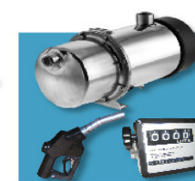
Pumps & Accessories