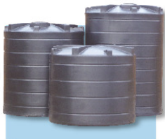
Water Storage Tank

Steel Plastic Pumps, Filters & Flow meters