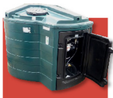
Bunded Diesel Tanks

Steel Plastic Pumps, Filters & Flow meters