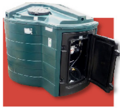
Bunded Diesel Tanks

Steel Plastic Pumps, Filters & Flow meters