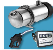
Pumps & Accessories